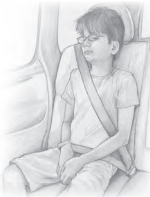
FIGURE 6. Lap and shoulder seat belt.