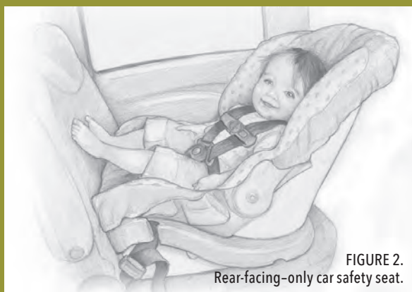
FIGURE 2. Rear-facing-only car safety seat.