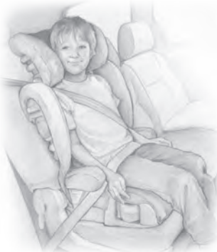
FIGURE 5. Belt-positioning booster seat.