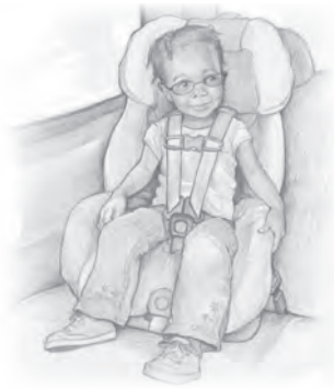
FIGURE 4. Forward-facing car safety seat with harness.