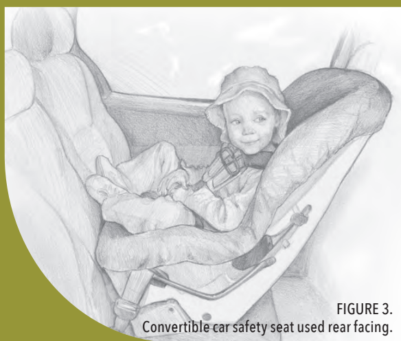
FIGURE 3. Convertible car safety seat used rear facing.